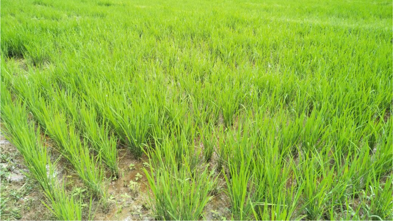
Image 3: Field on 12 th day after application of Jaivasakthi granule.